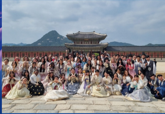
Hanbok Experience at Gyeongbokgung Palace