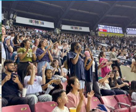
Baseball Game Experience