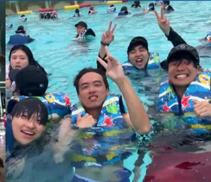
Caribbean Bay Waterpark