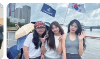
Han River Cruise