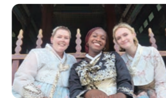
Royal Palace Visit