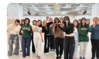
K-Pop Dance Class